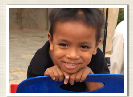
MY MAN, HOSEA