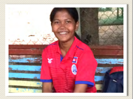
ALWAYS CHEERFUL LEAK